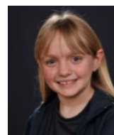
Jasmine Brick Deputy Prime Minister