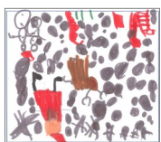
Frankie Barker Class 2