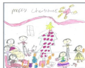
Faith Gower Class 3