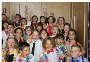
Chaddesley Leavers 2015